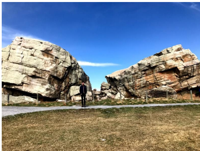
Okotoks Erratic